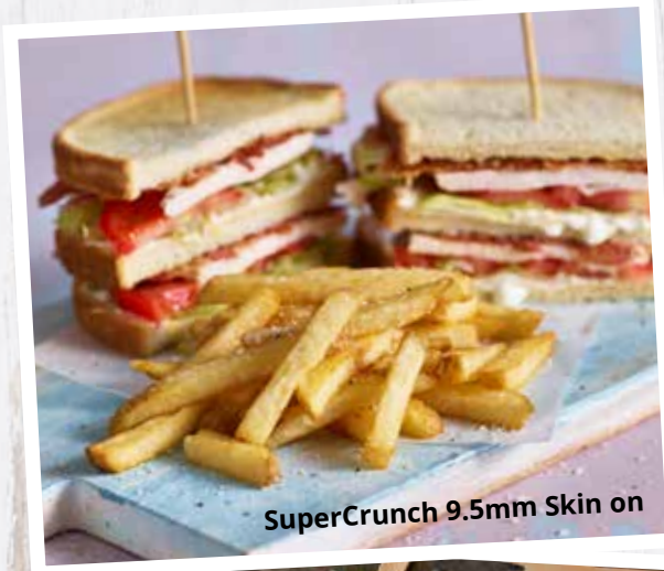
SuperCrunch 9.5mm Skin on