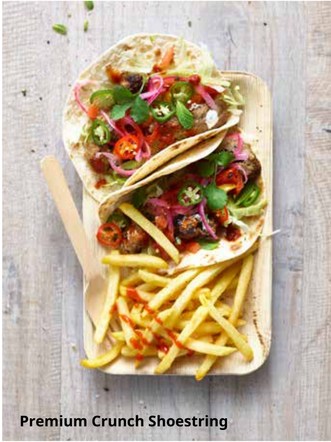
Premium Crunch Shoestring