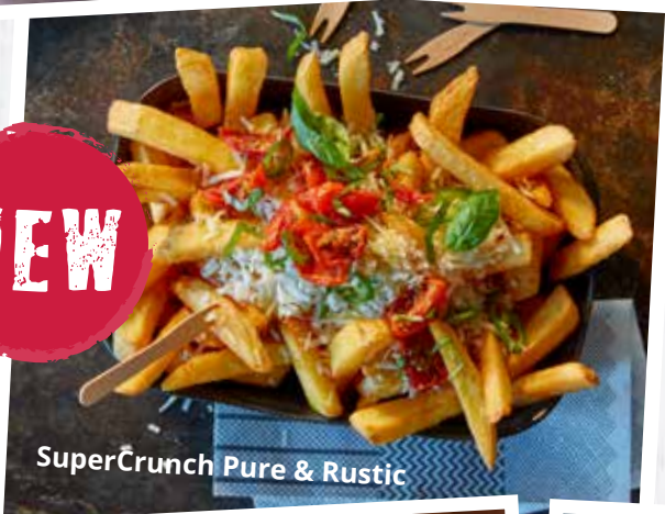
SuperCrunch Pure & Rustic