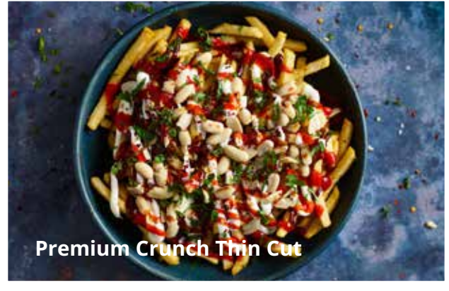
Premium Crunch Thin Cut